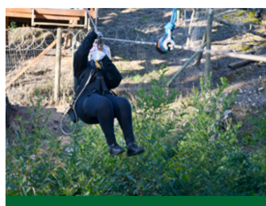
Minister Kubayi-Ngubane on the zip ride